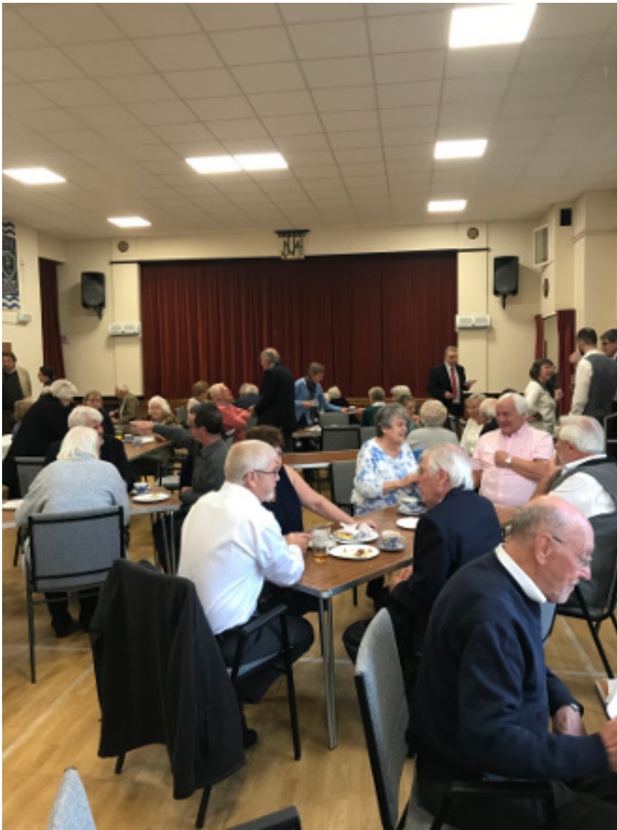
Jawing in the Jubilee Hall